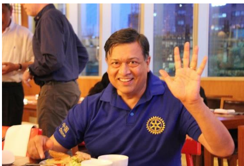
2 Past Presidents, 1 Immediate Past President and 1 President at 1 fellowship evening.....