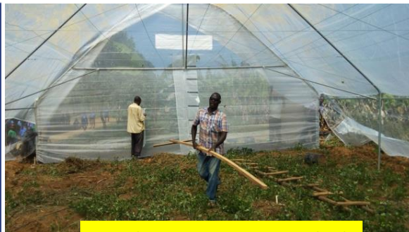
Greenhouse at Kaaso Primary School